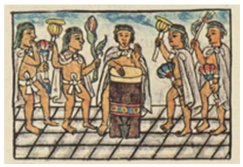
Dancing at a merchant's banquet (Bernardino de Sahagún, op.cit., Book 9, folio 30v, vol. 2).