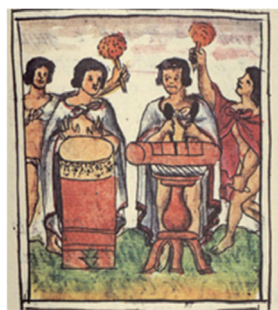
Huehuetl and teponaztli players at a feast for a newborn child (Bernardino de Sahagún, Códice florentino, México: Gobierno de la Republica, 1979, Book 4, folio 70, vol. 1).