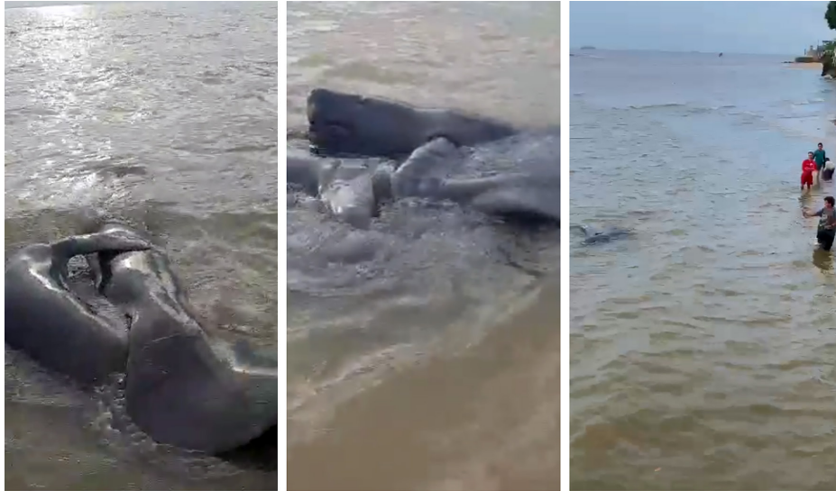
Figure 3. Mating herd of Amazonian manatees ( Trichechus inunguis ) filmed on Bispo Beach, Mosqueiro Island, near Belém, Pará, Brazil, 31st October 2021. Note the so-called ‘manatee ball’, as usually reported by fishers and locals for mating groups of manatees. Images captured from popular videos.

was obtained, such as the native vegetation banks that comprise part of the known diet for the species. Regarding their appearance in shallows Mosqueiro waters, Bonvicino et al. (2020) commented that the affluence of the enormous amount of freshwater during the Amazonian rainy season (December-June) may favor the spread of Amazonian manatees throughout the Belém coastline and adjacent islands. This environment provides abundant vegetation for manatee foraging, including Avicennia nitida , Rhizophora mangle , Laguncularia racemosa , Montrichardia arborescens , Spartina brasiliensis , Eichhornia crassipes and Eleocharis interstincta (Best, 1981; Best & Teixeira, 1982; Guterres-Pazin et al. , 2014) (Figure 4).