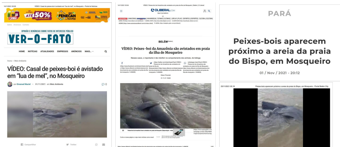
Figure 2. Mating herd of Amazonian manatees ( Trichechus inunguis ) filmed on Bispo Beach, Mosqueiro Island, near Belém, Pará, Brazil, 31st October 2021. Images captured from popular videos.