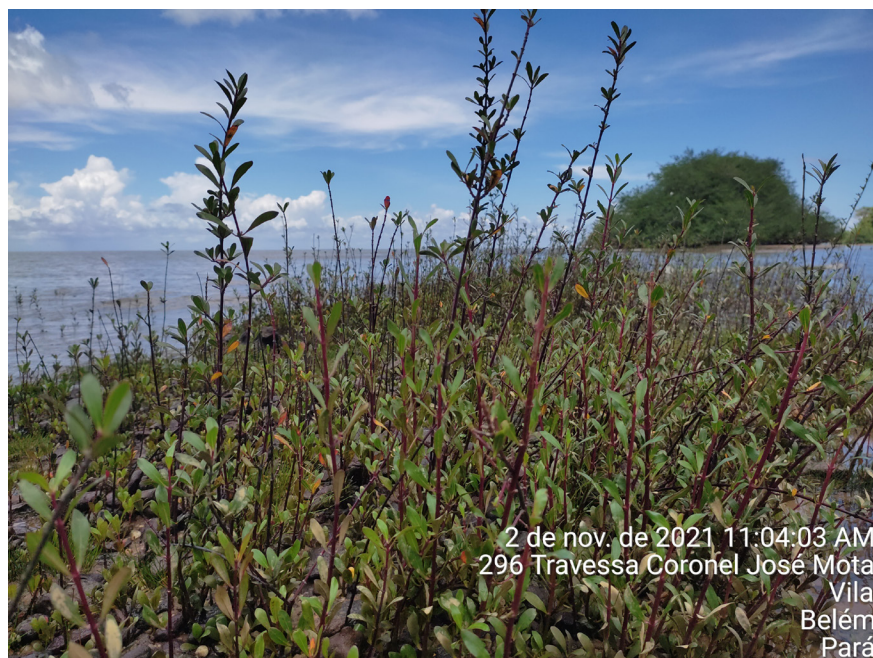
Figure 4. The environment where the courting behavior of Amazonian manatees was observed in Mosqueiro, Belém, Pará, Brazil, a suitable habitat for sirenians.

or sites make many marine mammal populations particularly vulnerable to climate change (Silber et al. , 2017). Manatees could, thus, have benefited from this condition and gathered in the region, resulting in this mating aggregation. In such a case, female in estrus can attract reproductive males or subadults looking for a chance to reproduce (Hartman, 1979).