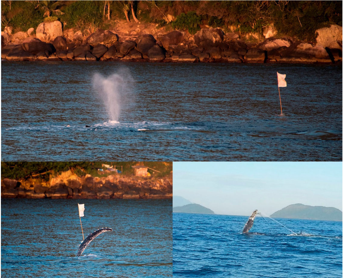
Figure 2. Yearling humpback whale ( Megaptera novaeangliae ) entangled in a gillnet off Ilha dos Búzios, São Paulo, on June 17 th , 2017.