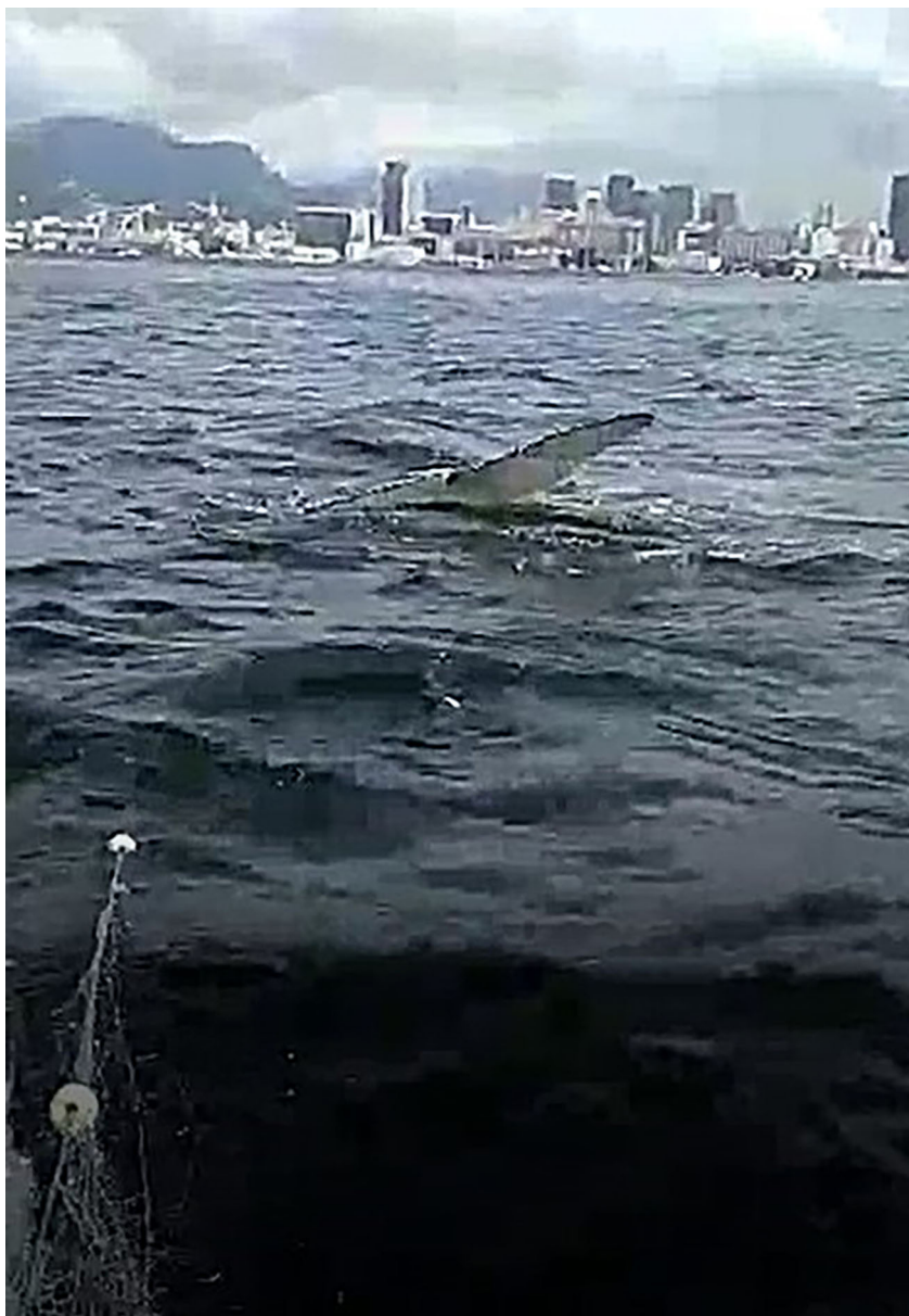
Figure 3. Yearling humpback whale ( Megaptera novaeangliae) entangled in a gillnet set off Icaraí, Niterói, mouth of Guanabara bay, Rio de Janeiro on July 6th, 2018.