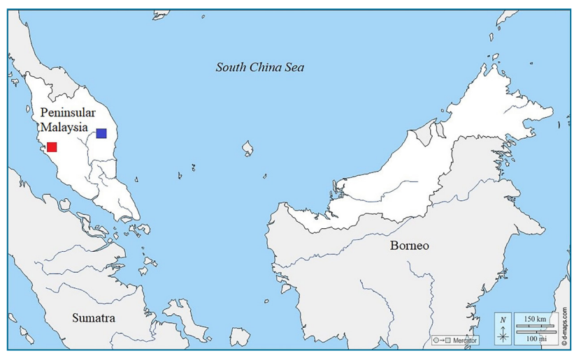
Figure 2. Records of F. kittipongi in Peninsular Malaysia. New record from Pahang River, Kuala Lipis, Pahang (blue square), and previous record from Perak River (red square) provided by Grant et al. (2021).