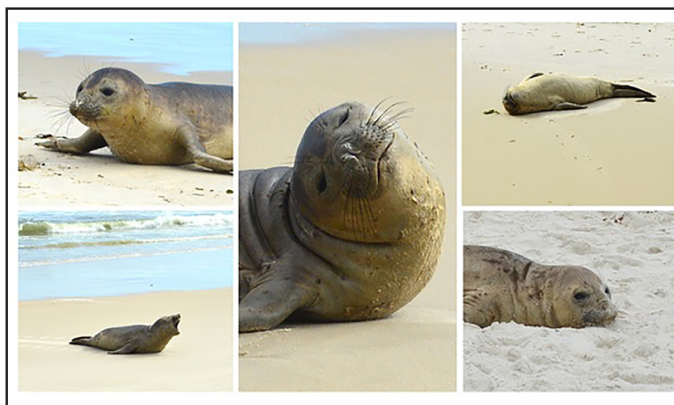
Figure 2. Young elephant seal reported at Barra da Tijuca, a beach located in the city of Rio de Janeiro, in the state of Rio de Janeiro, Brazil.