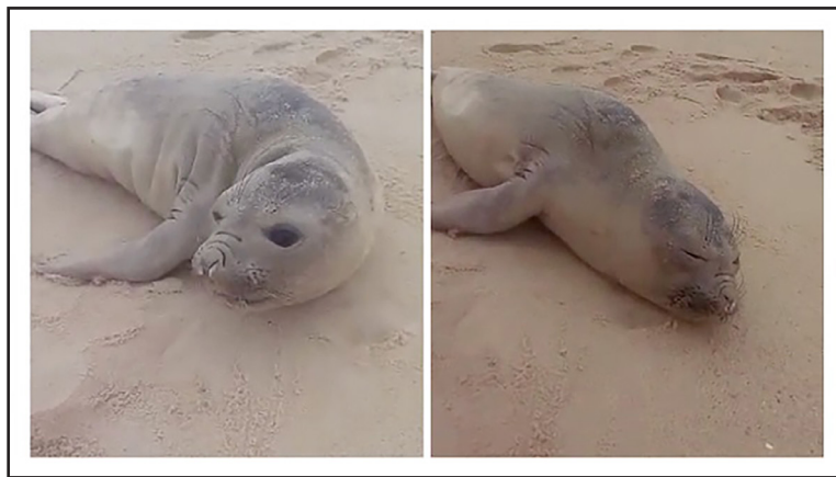
Figure 1. Young elephant seal reported at Açú, a beach located in São João da Barra, on the northern coast of the state of Rio de Janeiro, Brazil. Photos are stills taken from a video made by the beach patrolling team.

Approximately one month later, on 3 March 2020, the arrival of an infant elephant seal at 10:30 AM on the beach of Barra da Tijuca, Rio de Janeiro was reported by one the authors (C.E.S. Amorim). The specimen was a male, 1,30m long, and rested all day at the same spot (Figure 2). At night it went out back to sea. It defecated on the sand. The body had numerous barnacles attached, very probably Conchoderma auritum , as previously observed on specimens at Arraial do Cabo and Vila Velha, SE Brazil (Magalhães et al. 2003; Mayorga et al. 2017) and in South Africa (Best, 1971).